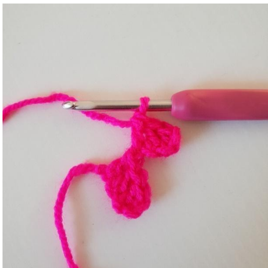
3. Virka stolpar i de nästa 2 lm. Nu har du en till pixel