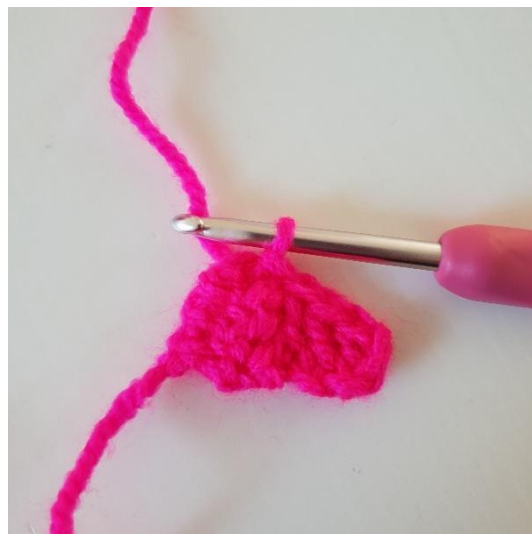
4. Nu ska pixeln virkas ihop med den första pixeln, gör det genom att vända på pixeln och göra en sm i vänstra sidan på den första pixeln. På bilden ser du dom ihopvirkade.