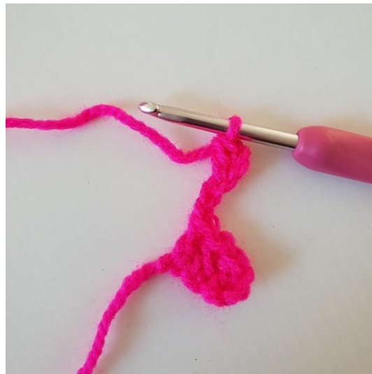
2. Virka 1 stolpe i tredje lm från nålen