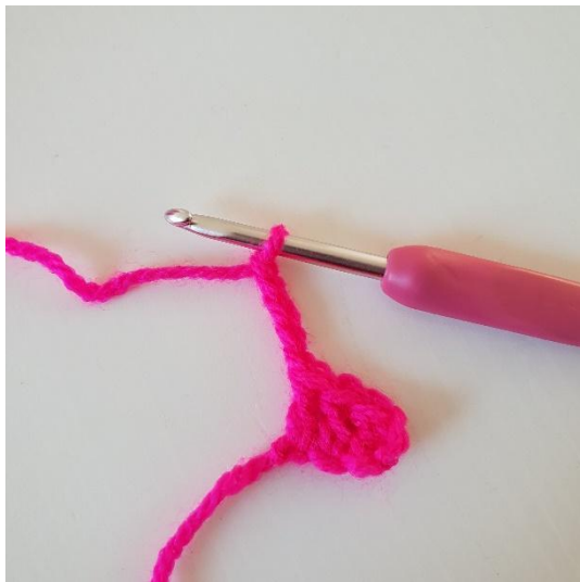
1. Gör 5 luftmaskor