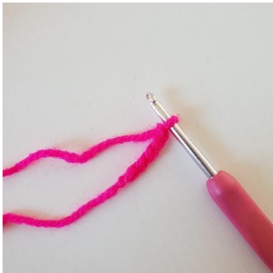
1. Börja med att göra 5 luftmaskor