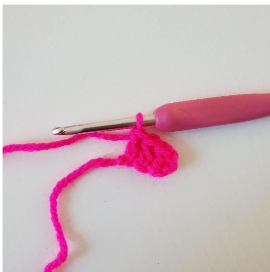
3. Gör stolpar i de nästa 2 luftmaskorna. Du har nu gjort din första pixel